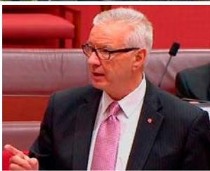
Senator The Hon. Doug Cameron , Shadow Minister for Housing and Homelessness

The Housing Affordability Summit is for people prepared to drive the change needed to make housing affordable.