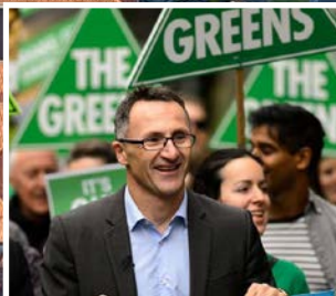
Senator Richard Di Natale , Leader, Australian Greens