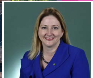
The Hon. Rebekha Sharkie MP , Federal Member for Mayo