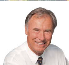
The Hon. John Alexander MP , Member for Bennelong